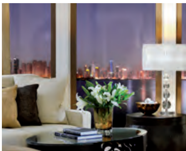
Below: Low Rise Mansion – suite living area. Opposite: Low Rise Mansion – suite bathroom.

Throughout the resort, guests will enjoy the genuine hospitality and gracious service for which One&Only is renowned.