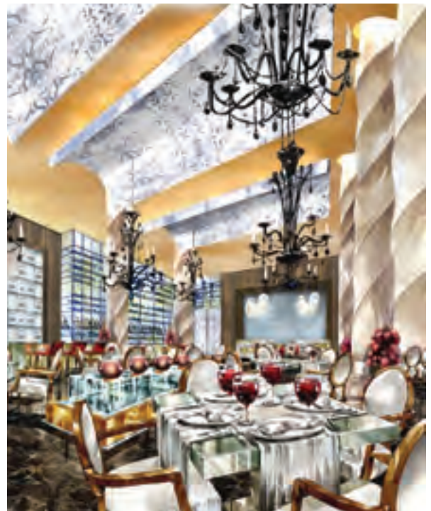
Opposite: Dining at the 'Conservatory'. Below: Romantic dining.

Deep earth tones, rich marble floors and an intricately patterned crystal ceiling will provide an atmosphere of sophisticated romance for evening dining on contemporary Italian cuisine.