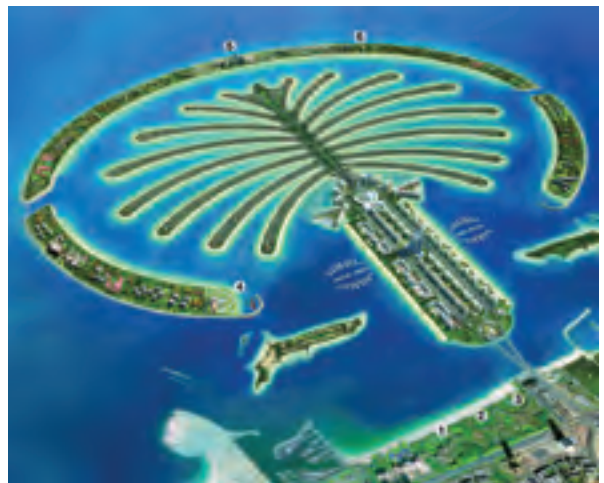
Below: 1 The Palace. 2 Residence & Spa. 3 Arabian Court. 4 One&Only The Palm. 5 Atlantis, The Palm. 6 Aquaventure.

With its enviable location on one of Dubai's most ambitious developments, Palm Jumeirah, guests will be mesmerised by striking views of a world-renowned destination just beyond the resort's exclusive marina and private harbour.