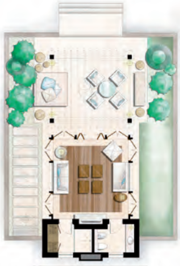
Opposite: Manor House terraces and pool Above: Grand Pool Cabanas with HD, Hi-Fi, LCD, internet, over-sized designer day bed on water pods

Under the gentle cover of hundreds of palm trees, guests may indulge in the tranquility of the pool with its lavish daybeds, concierge service and relaxing music. Six private cabanas offer superior comfort with every conceivable amenity.